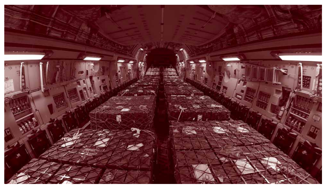
During Operation Impact, a Royal Canadian Air Force aircraft-photographed in the Czech Republic-transports pallets of military supplies donated by Albania and the Czech Republic to security forces in Iraq, September 2014.

National export reports do not disaggregate sales of surplus from sales of new ordnance, yet RASR countries have provided some information. Bulgaria noted that it sold more than 5,000 tonnes of excessive ammunition in 2011, more than 8,775 tonnes in 2012, and 2,208 tonnes in 2013, with the latter figure representing about 31 per cent of its estimated 7,075 tonnes of surplus in 2013 (Bulgaria, 2012, slide 4; 2013, slide 5). The Croatian MoD reported sales