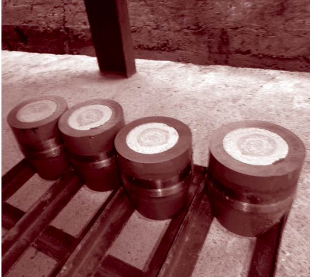
High-explosive projectiles are processed for demilitarization using an industrial bandsaw (top), and the resulting opened shells are transported away on forklifts, for the removal of energetics (bottom), ULP Mjekës, Albania, 2011.

Secondly, it is unclear to what extent MoD-owned plants such as Mjekës and TRZ Kragujevac can become commercially viable and competitive in the open market. Such facilities often function as military units, featuring older technology and lower production volumes than their private, civilian competitors. In particular, they are not able to adapt to the constraints of regional or international demilitarization markets, where commercial considerations play an increasingly important role. The NSPA completed US-funded destruction activities at the ULP Mjekës and Gramsh plants at the end of December 2014. At the time of writing it was unclear how they would pursue their demilitarization activities without donor assistance.