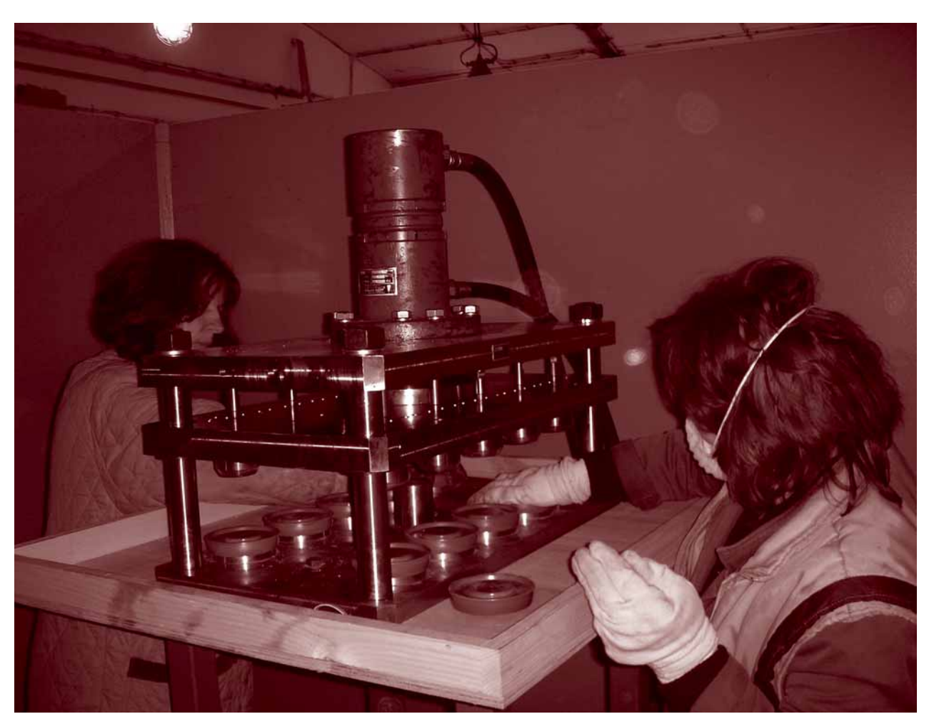
Trained staff dismantle anti-personnel mines at TRZ technical overhauling facilities in Kragujevac, Serbia, April 2007.

Large government-owned facilities tend to declare their capacity figures and approximate demilitarization costs. As these are context-specific, care must be taken when making comparisons between nations. Albania's main plant— ULP Mjekës—has a total capacity of more than 5,000 tonnes per year across a broad spectrum of ammunition types, at approximately EUR 500/tonne (USD 565/tonne) (NSPA, 2014, slide 23). The Serbian MoD's TRZ plant in Kragujevac reportedly dismantled approximately 4,000 tonnes of ammunition per year between 2006 and 2010 (Serbia, 2011a, slide 4; 2011b, slide 5). Serbia has repeatedly stated that the plant is underutilized and that it could increase its capacity to anywhere between 6,000 to 10,000 tonnes per year by opening additional demilitarization lines (Serbia, 2011b, slide 13; 2011d, p. 3). In 2011, the plant reported an average demilitarization cost of EUR 780 (USD 1,080) per tonne, but calculated that economies of scale linked to the potential capacity increases could bring the cost down to