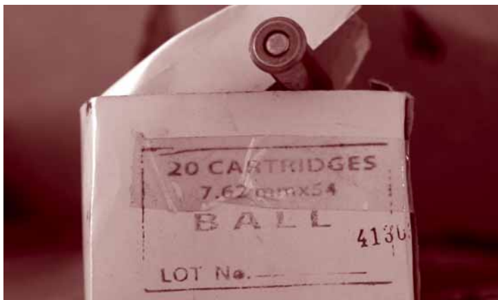
Figure 6.7 (excerpt) Case head of unmarked 7.62 x 54R mm ammunition, Mogadishu, 2014

It is important to note that the producing countries identified in this chapter are not necessarily responsible for transferring the ammunition to the conflict environments and actors under study. Indeed, producers may have exported the ammunition legally to these or other countries before it was retransferred without their knowledge and used in conflict, or diverted to non-state armed groups or illicit markets. Information on producers is nevertheless important in generating a baseline of the ammunition in circulation, which in turn may facilitate the identification of unusual or new ammunition flows over time and across borders. Moreover, identifying