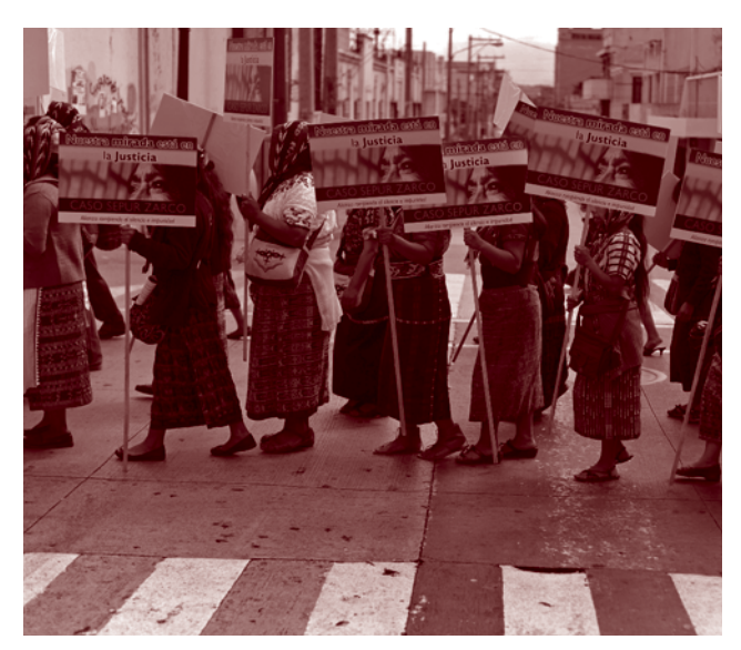
Women hold signs that refer to Sepur Zarco, a military base where sexual slavery took place during the country's conflict, during a demonstration for the International Day for the Elimination of Violence Against Women, Guatemala City, November 2012.