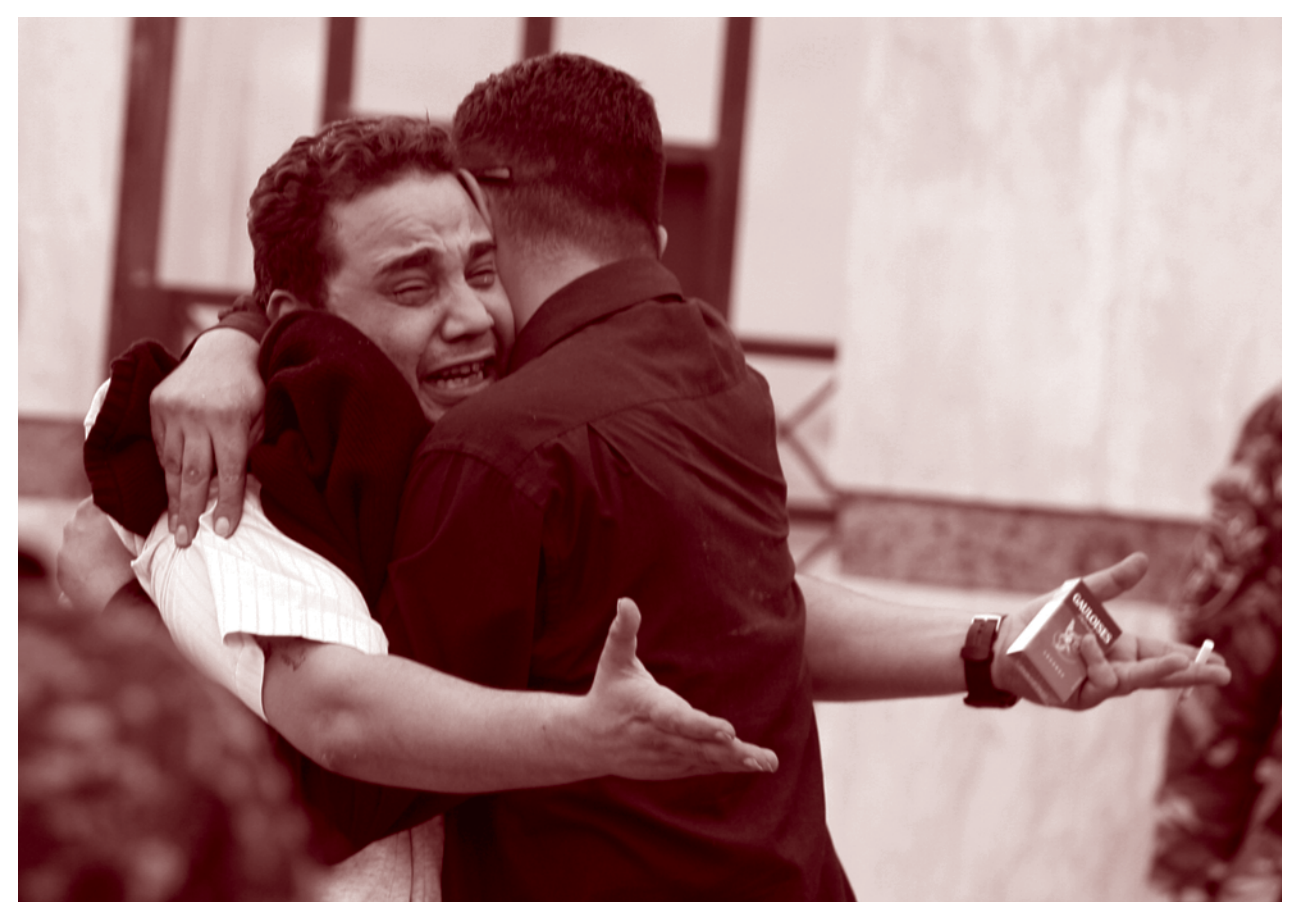
An Iraqi man mourns the death of his wife who was killed following an attack, claimed by Al-Oaeda, on the Syrian Catholic Church, Baghdad, November 2010.

Generally, for the ATT to make a difference for women, states parties will need to develop robust processes by which to assess the risk that weapons could be used to commit or facilitate serious acts of gender-based violence or violence against women—and then act to deny arms export authorizations if such risks arise. Many questions remain as to how this risk assessment will be undertaken, who will do so, and how women and women's organizations will