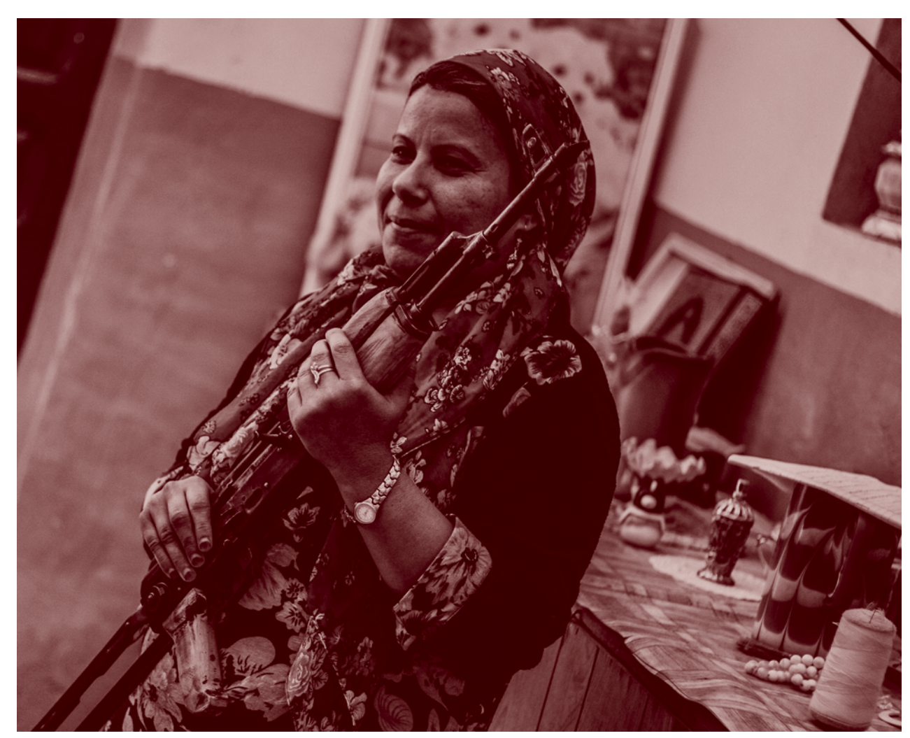
A woman poses with her husband's assault rifle in the weapons workshop that he runs from their home, Misrata, Libya, June 2011.

During and following conflict, women, men, boys, and girls face multiple forms of violence and deprivation as direct and indirect consequences of small arms prevalence and misuse. Research in Cambodia, for example, has