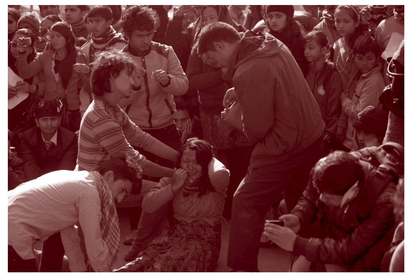
Nepalese activists perform a street drama during a protest against increasing violence against women, Kathmandu, January 2013.

Sexual violence was widely used as a weapon of war by all sides during the ten-year civil conflict. In 2004 alone, the media reported on 367 cases of conflict-related rape. That same year, between 1,040 and 1,200 women were reportedly murdered, injured, raped, or abducted (UNFPA, 2007, p. 5). Sexual violence during the conflict was severely under-reported, due to fears of repercussions, repeat victimization, and social and cultural taboos (TRIAL and HimRights, 2013, pp. 5–6).