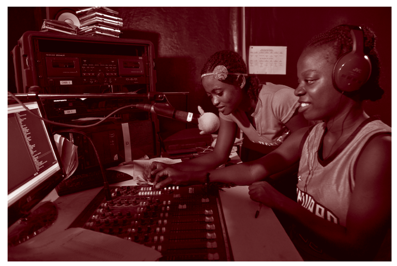
A community radio station in Sinoe County broadcasts programmes on key social issues, including those related to health, women, and children's rights, Liberia, April 2012.

One such project was entitled Men and Women in Partnership–Liberia. A four-month initiative funded by Irish Aid and implemented by the International Rescue Committee, it was designed to examine Liberian men's knowledge, attitudes, and beliefs about gender relations and VAWG and to encourage participants to practice gender-equitable behaviour in their homes and communities. The project urged participants to take concrete steps to equalize the balance of power between themselves and the women in their lives. Change was effected through a curriculum of workshops and training sessions aimed at altering social norms around VAWG (IRC, 2011, pp. 2–4, 13).