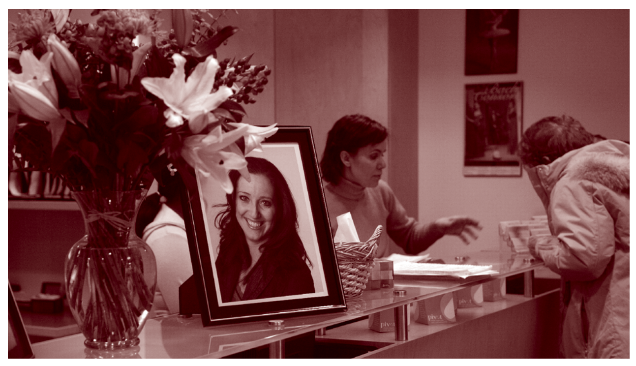
The photo of a victim of a double homicide, targeting her and a second woman, is displayed at the reception of her former workplace.

VAWG has emerged as a focus area for research and policy-making in recognition that gender-based victimization of women is widespread, follows some identifiable patterns, and is deeply rooted—in the sense that it may be condoned or acceptable according to prevailing social norms. These gendered and normative considerations are built into the term violence against women and girls .