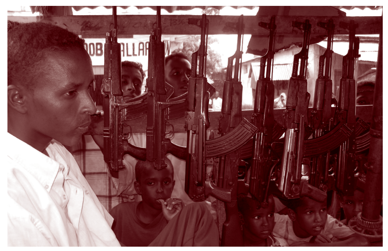
An arms dealer who began trading at the age of ten at his stall in Bakara market, Mogadishu, Somalia, June 2006.