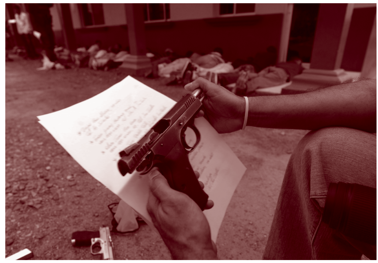
Police seize a cache of weapons from alleged gang members in Tequcigalpa, Honduras, June 2012.

tackle the problem on their own. No peacekeepers are sent to assist the state in its efforts, which may be uncoordinated, focused exclusively on one sector, or generally limited if institutions are weak. Multilateral initiatives that aim to reduce armed violence in both conflict and non-conflict settings, such as the Geneva Declaration on Armed Violence and Development, remain underutilized (Geneva Declaration, 2006).