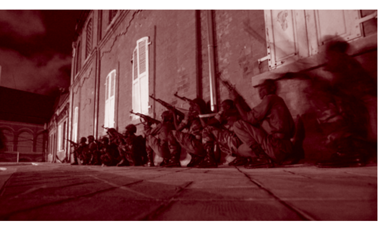
Rebel soldiers loyal to Andry Rajoelina take over one of the presidential offices in downtown Antananarivo, 16 March 2009.

The chapter has two main sections. The first section reviews the historical context and development of the security sector in Madagascar, noting the specific ways in which the armed forces have continuously been subject to strategies of dispersion and co-optation by colonial and post-colonial governments. Not only has this process led officers to abuse their positions in the pursuit of personal gain, but it has also transformed Madagascar's armed forces into pawns of predatory actors seeking to further their own political and economic agendas. The second section analyses