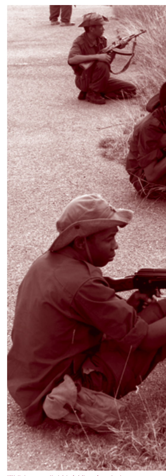
With Madagascar on the brink of civil war, forces loyal to Marc Ravalomanana patrol the area around the town of Ambilobe, 2 July 2002.

The 1992 constitution of the Third Republic, which set itself the task of creating a parliamentary regime focusing on a devolution of centralized power, soon transformed into a semi-authoritarian pres-