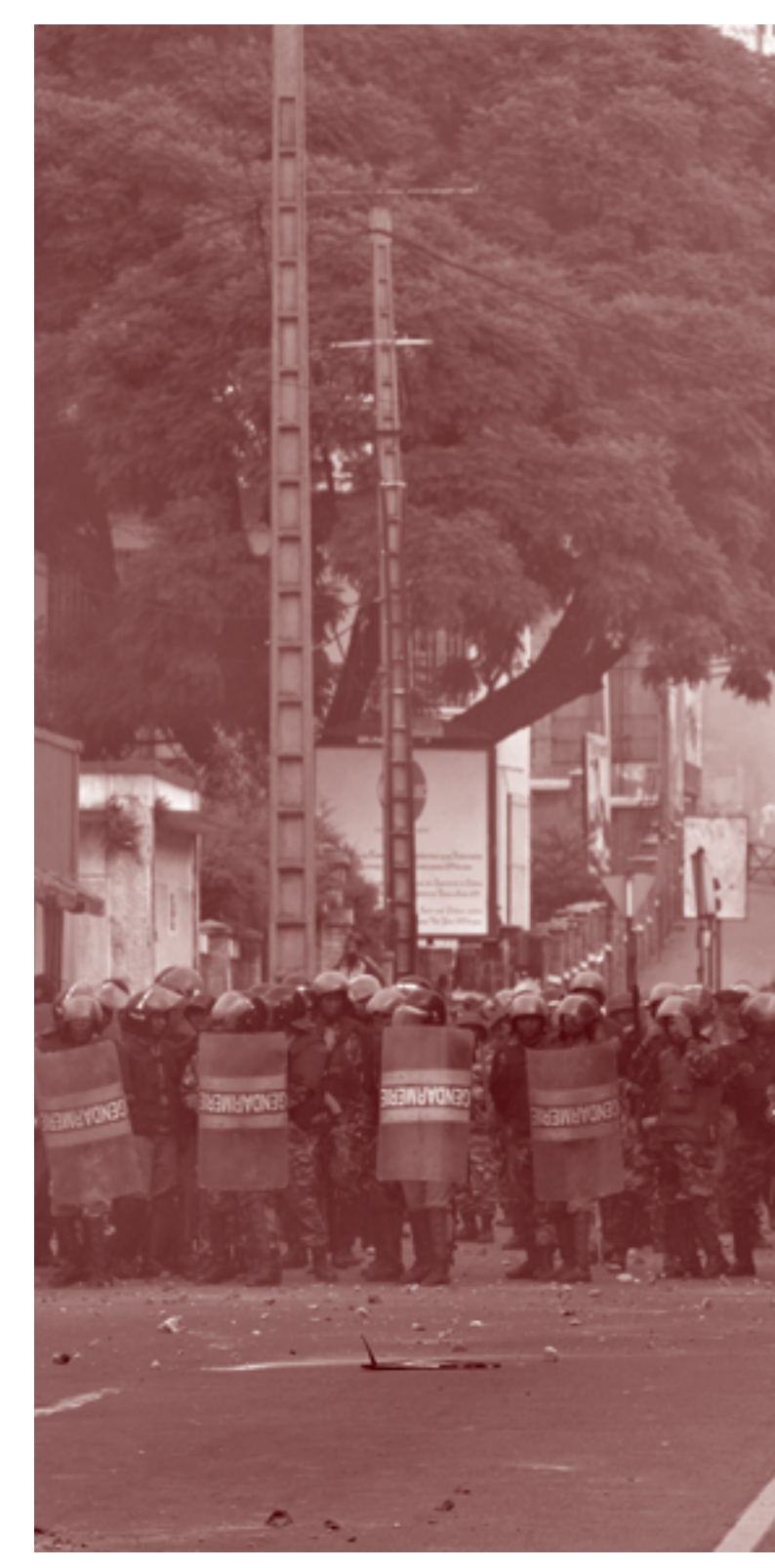
Two men take cover as police fire tear gas and warning shots to disperse anti-government crowds, 16 February 2009.

The process by which President Marc Ravalomanana lost power in March 2009 is illustrative of the ways in which the security sector has itself become part of Madagascar's security challenges. Technically, Ravalomanana was not overthrown by a violent military coup but simply lost control of the security apparatus. The protest movement led by Andry Rajoelina had been brutally repressed on 7 February 2009 and the military and gendarmerie, under the direction of the joint staff, EMMONAT, had successfully quelled the riots in the capital. Andry Rajoelina quickly