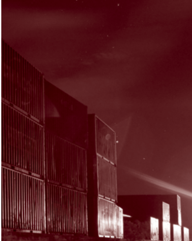
The small port of Vohémar is alleged to be one of the main shipping points for rosewood trafficking.

The political economist Ronen Palan has coined the term 'antisovereign spaces' to describe some of the conditions favouring international criminal networks (Palan, 2009, p. 36). Such operations are very much territorially oriented: they thrive in areas where central authority is weak but where the means of capital accumulation is still the traditional one of slowly amassing ill-gotten