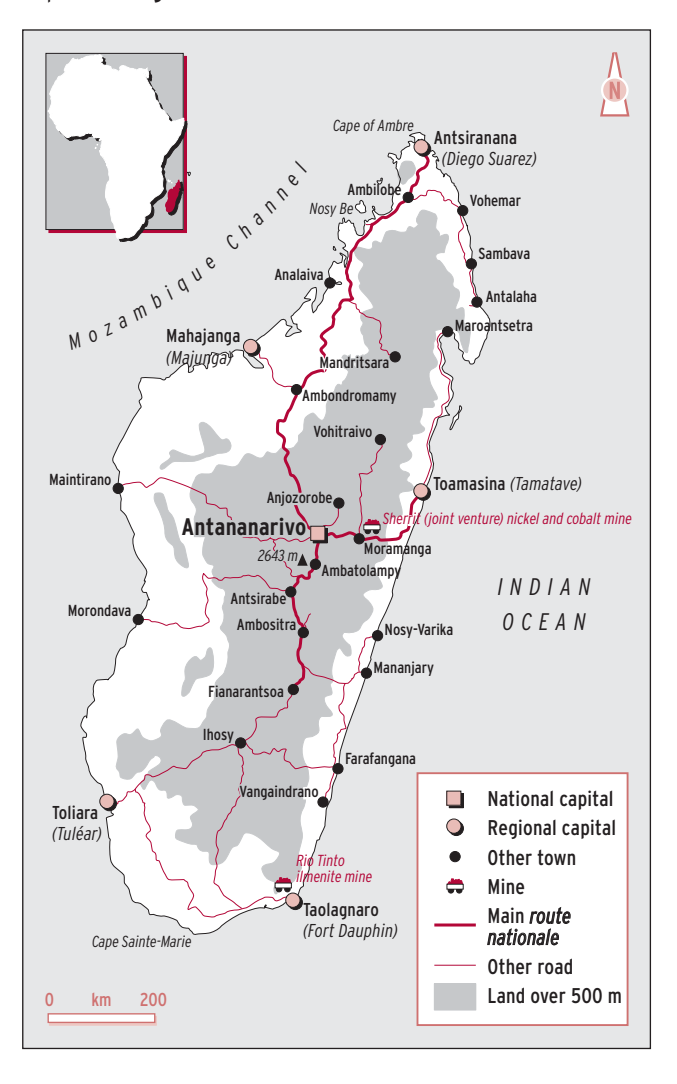
Map 6.1 Madagascar

Madagascar's political process and its administrative, societal, and economic institutions and practices were all shaped by the impact of colonial politics on traditional society. Yet while Madagascar is thus a classic 'imported state' (Badie, 2000), the island features a series of structural particularities. In fact, Madagascar's plight cannot be grasped without an understanding of the historical dynamics that have led to the blurring of national interest and private benefit—and, ultimately, to the country's dysfunctional security sector.