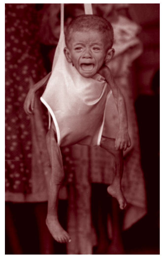
A one-year-old famine victim cries at a feeding centre in Amboasary, southern Madagascar, 1992. Famine continues to haunt parts of the island in 2011.

rural communities are the ones suffering most from the current lawlessness. While the gendarmerie and specially designed military units are operating in rural areas, they may be poorly equipped, lack means of transportation, or even collude with attackers. Regularly undermined by spontaneous roadblocks, the routes nationales have become so unsafe that travel along certain sections is now only permitted in a convoy that is escorted by the gendarmerie; bus passengers are prohibited from using their mobile phones, in order to avoid tip-offs (Andriamarohasina, 2010a).