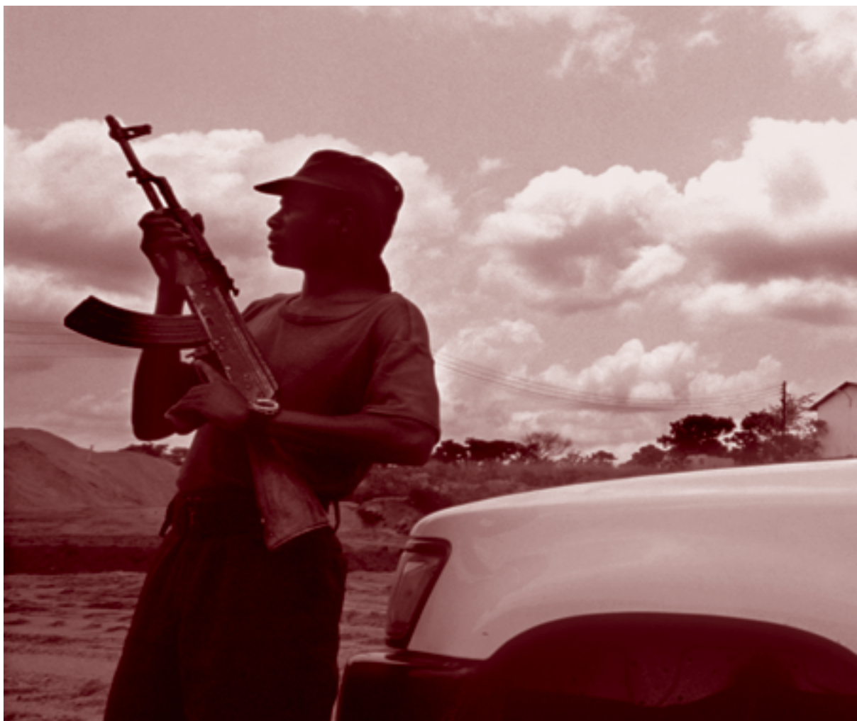
An armed security guard watches over an official diamond mine in Lunda Norte, Angola, 1992. The Brazilian company Odebrecht operates the mine on behalf of the Angolan government.

The wide variety of security arrangements MNCs use around the world may be illustrated as straddling a spectrum. In certain countries, corporations are required to use public security in some form, perhaps because the host government requires public security at certain facilities (such as oil installations) if they are deemed sensitive or 'of national interest'. 41 Alternatively, a government may prohibit PSCs from carrying arms, obliging an MNC to call on the state when it needs or wants armed protection. Even where MNCs are not legally obligated to use public forces, they might choose to use them as a supplement to private security, as in areas of conflict in countries where the armed forces are considered capable and a functioning state exists. Elsewhere, a host government may require companies to