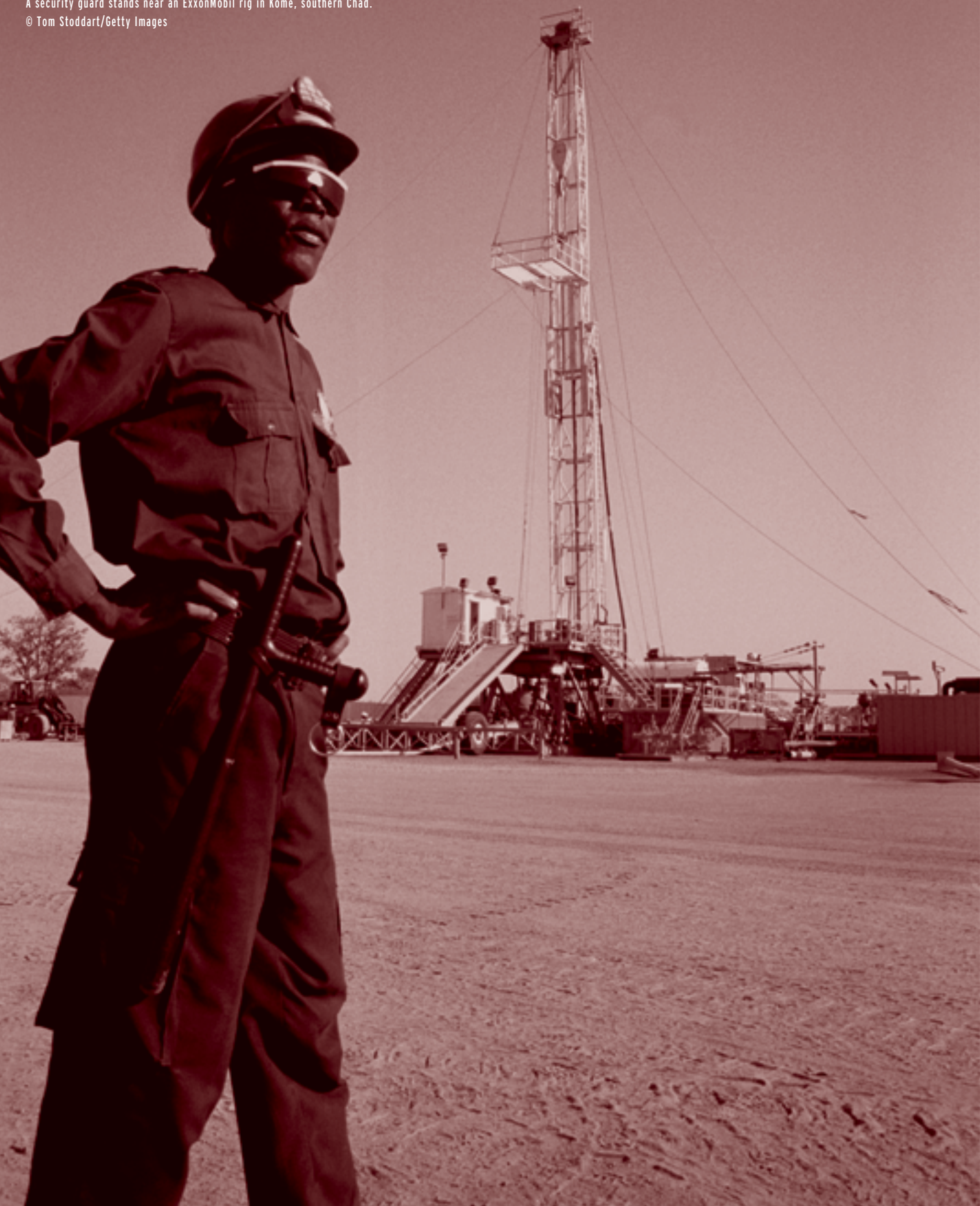
A security guard stands near an ExxonMobil rig in Kome, southern Chad.