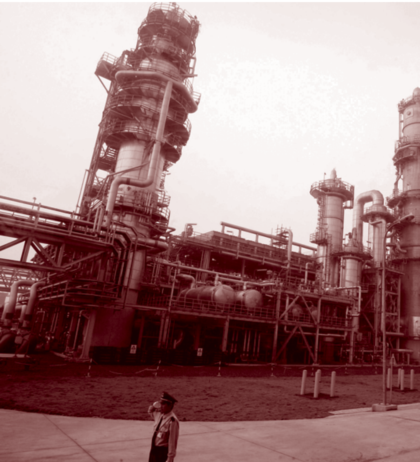
Security personnel guard the chemical plant of the BASF-SINOPEC joint venture in Nanjing, China, September 2005.