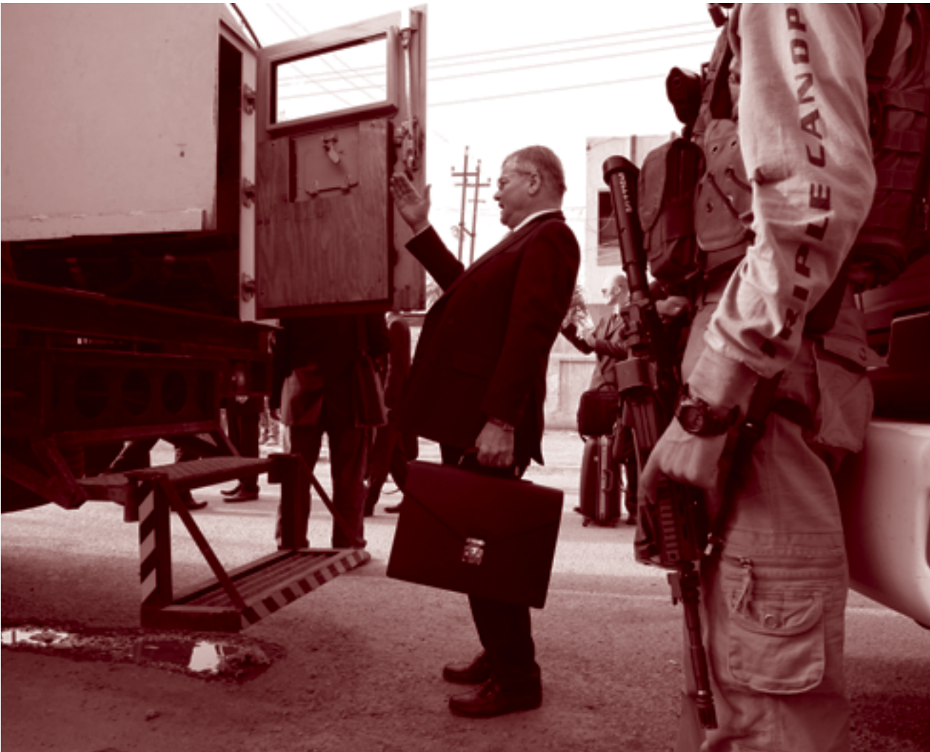
A French businessman, the general director of Technip, prepares to enter an armoured vehicle during his Baghdad visit with the French industry minister in February 2010. Corporations sometimes use private security for close protection of VIPs.

The chapter focuses on MNC use of PSCs for several reasons. First, MNCs are among the top consumers of private security and thus help drive PSC industry expansion. 10 Second, MNCs are at the heart of the current debate about corporate social responsibility. Third, they are particularly sensitive to controversies involving their private security contractors because of heightened scrutiny by civil society organizations.