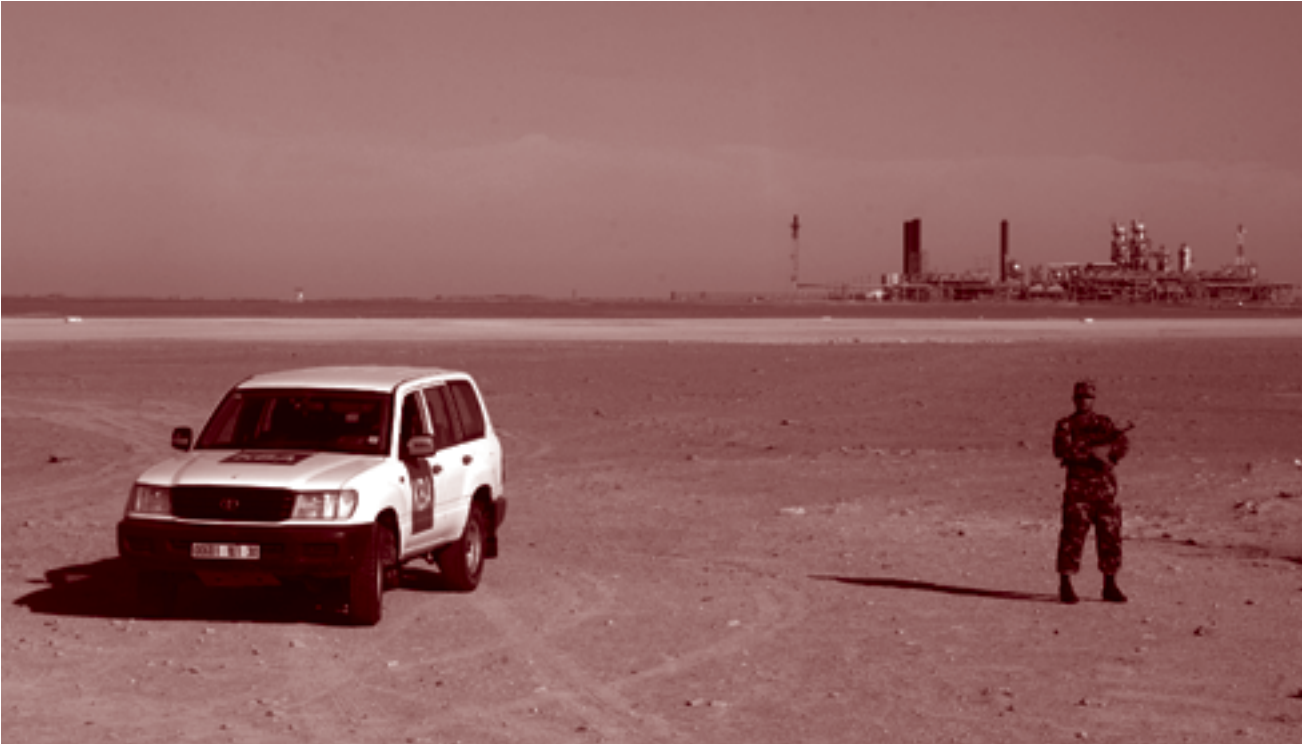
A security officer stands guard over the In Salah Gas Krechba project, run by Sonatrach, BP, and StatoilHydro, in Algeria's Sahara Desert, December 2008.