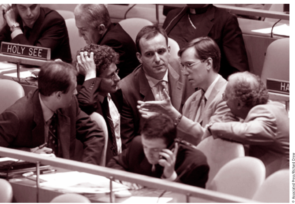
Multilateral diplomacy produced a consensus Programme of Action, but no commitment to negotiate legally binding instruments.

The Programme is the first global framework to guide the work of national governments, regional and international organizations, and civil society in combating the illicit trade in small arms, and has served to raise the level of commitment of states to address the illicit trade in small arms. It provides the justification for all actors, including NGOs, to monitor, report on, encourage, and if necessary apply political pressure to those states that are not meeting their commitments.