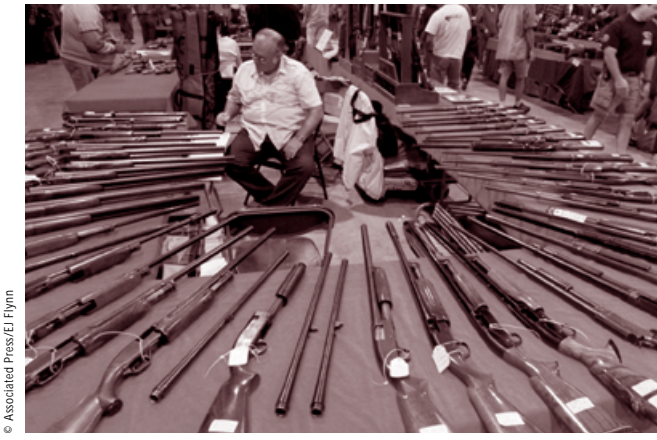
Small arms for sale, California.

The US is recognized as one of the world's major small arms producers and exporters. During the period 1993–2000 the US was ranked as the world's major supplier of conventional arms to developing countries with sales of USD 61.5 billion, an average of USD 7.6 billion a year (Grimmett, 2001). More than 300 local companies produce small arms and/or ammunition, and the country is estimated to have one of the world's largest domestic markets for small arms (United States, Census Bureau, 1997a; 1997b). Without exception, there is more official and unofficial information about the production of small arms in the US than for any other country.