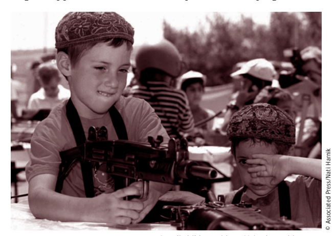
Israeli children with an Uzi sub-machine gun.

Israel is one of the world's most important arms producers and exporters. The country was ranked as the seventh largest supplier of conventional weapons to developing countries in the period 1993–2000 with sales of USD 2.6 bil-