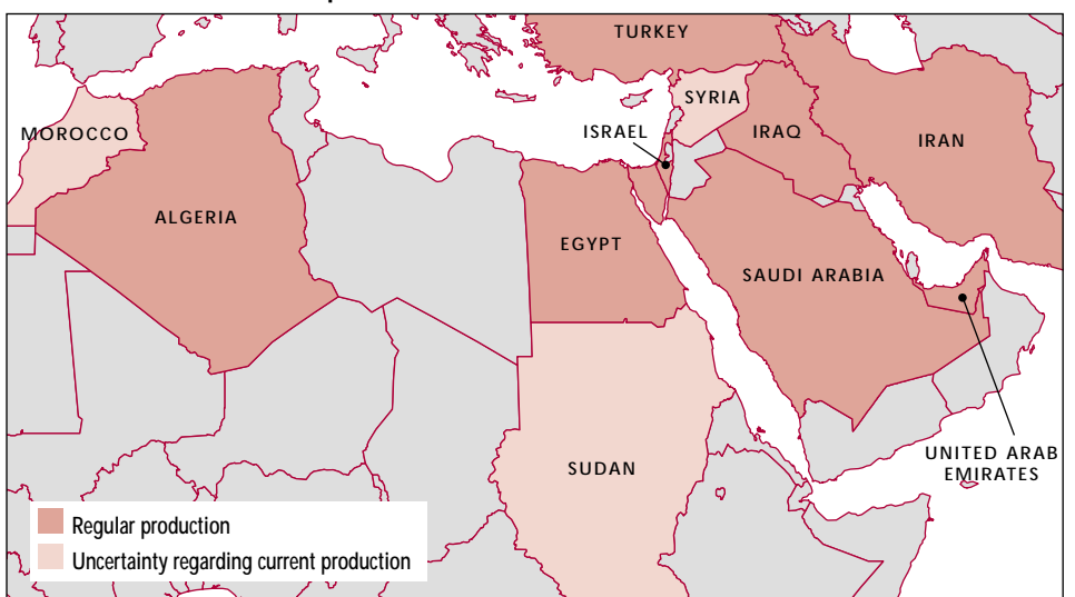
MAP 1.1 Small arms production in the Middle East

ber of domestic small arms producers.<sup>12</sup> Future editions of the Small Arms Survey will focus on small arms production, in terms of both countries and companies, in different regions.