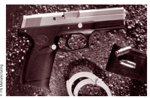
FN Herstal small arms products.

This section defines licensed production, and examines some of the conceptual aspects of licensed production and joint ventures. It provides case studies of two of the world's most significant licensors of small arms—FN Herstal (Belgium) and Heckler & Koch (Germany/UK)—and focuses on some of the countries in which their products are produced under licence. Neither Belgium nor Germany in the early Cold War period was a major defence producer, and both used licensed production to compete with some of the major producers such as France, the UK, the US, and the former Soviet Union.