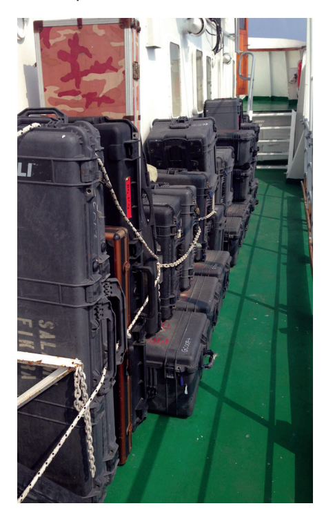
Photo 1 Storage of weapons on board a floating armoury off Fujairah, United Arab Emirates, 2014

equipment, using floating armouries to carry out such practices. A company storing arms on a floating armoury simply completes a 'transfer request form' to transfer the arms to another company that requires them to conduct a transit of a protected vessel. The transfer takes place with or without the knowledge of the owners of the floating armoury; the property of the first company is disembarked for use by the second company.