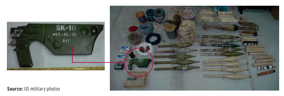
Figure 1 Gripstock for Chinese QW-1 MANPADS seized in Iraq

In a number of conflict zones, weapons and ammunition designed, manufactured, and distributed decades earlier—specifically in the context of cold war proxy arming—are often still in frequent use. A review of arms caches recovered in Afghanistan, Iraq, and Somalia revealed that the vast majority of seized small arms were Kalashnikov-pattern rifles and foreign variants—the same pattern of rifles that have been used by governments and armed