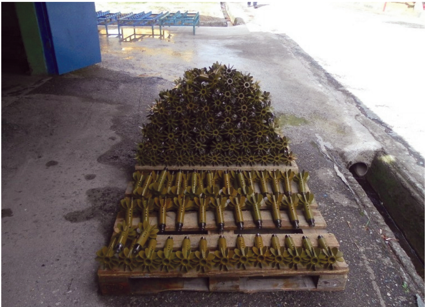
120 mm mortar tails at ULP Mjekës in Albania.

In any case, the government or international organization should reject