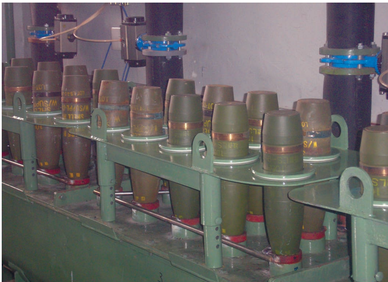
Discharge of TNT-filled projectiles.

Yet the environmental argument currently divides the demilitarization community, with proponents advocating professionally conducted OB/OD operations as a highly efficient process with negligible environmental impact. OB/OD remain the only practical and pragmatic solutions if stocks are too dangerous to move or if there are low economies of scale to be achieved within the national stockpile. Most armed forces, including within NATO, are keen to retain OB/OD as a valid, 'institutional' ammunition and explosives disposal method. The environmental impact can be managed by carefully selecting the location and the materials to be destroyed, and by continually monitoring the destruction