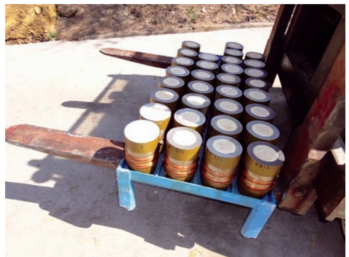
High-explosive projectiles being processed using an industrial bandsaw (left), and the resulting opened shells being transported for the removal of energetics (right).