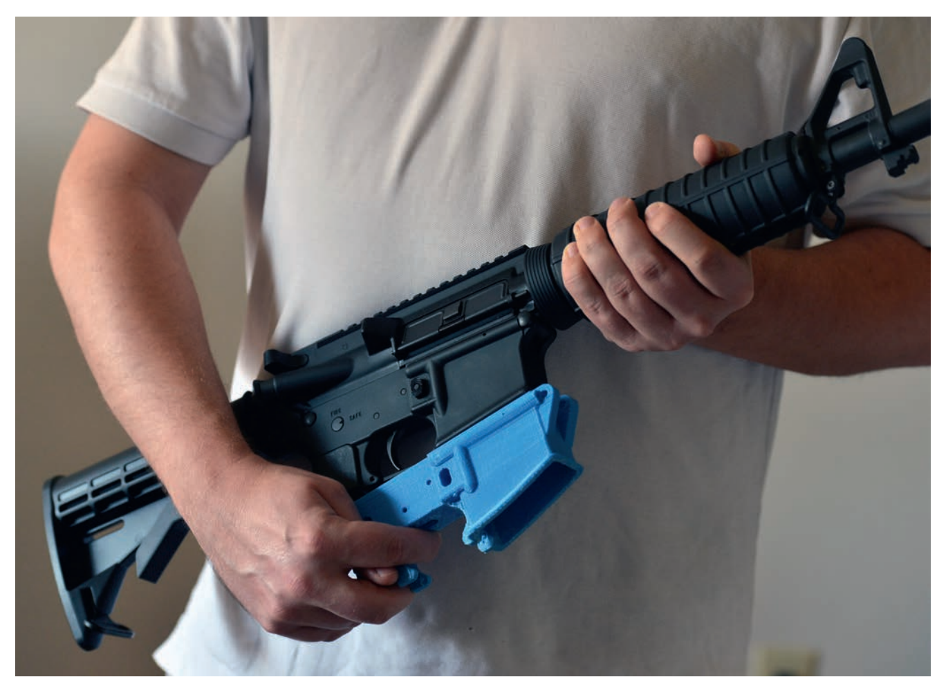
A man holds an AR-15 rifle and a lower receiver made of ABS plastic (in blue) that he made at his own home using a 3D printer, Maryland, United States, February 2012.

Participants at the third thematic symposium, held in Brussels from 20 to 21 November 2017, were asked to identify practical, actionable steps that the UN membership could take at the Third Review