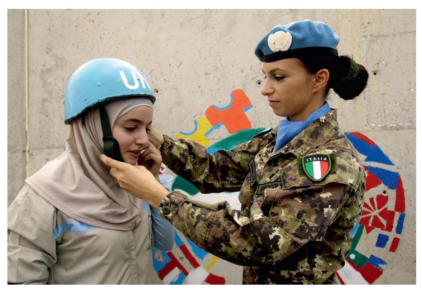
An Italian peacekeeper helps a Lebanese girl put on a helmet at the headquarters of the UN Interim Force in Lebanon (UNIFIL), Nagura, Lebanon, September 2013.

The BMS6 outcome acknowledges the connection between development and security through specific references to the