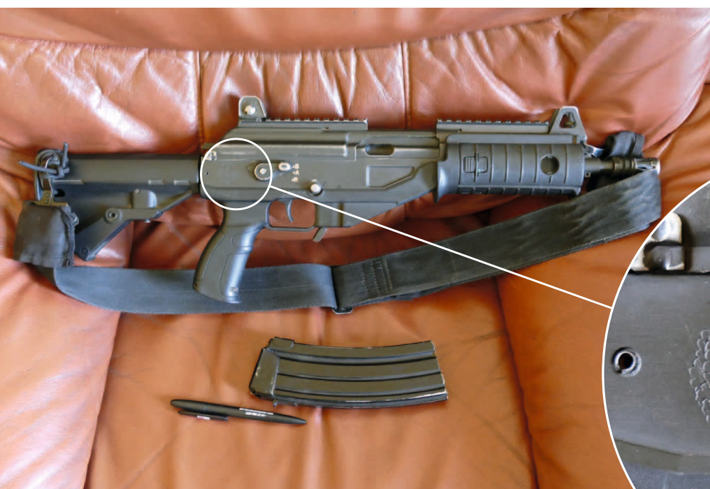
Galil ACE 21 assault rifle allocated to the Chad police force, with police marking. December 2017.

The German international cooperation agency (Gesellschaft für Internationale Zusammenarbeit – GIZ) is present in the three countries. While it has not provided