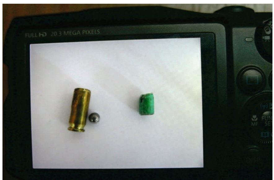
Post-test firing of a converted Ekol Tuna alarm pistol: cartridge case, steel ball, plastic wadding. Nouakchott Police Forensic Science Service, December 2017.