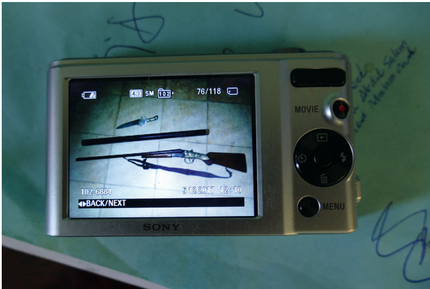
The arms used to assault a trader, photographed by the Nouakchott Police Forensic Science Service at the local police station. Mauritania, December 2017.

number had been ground off. 75 A more wide-scale seizure was carried out in Chad, involving the seizure of 35 arms and 238 cartridges. These arms included three alarm pistols, an AK-47 assault rifle, and several trade guns. 76 It is understood that these arms were traced via the iARMS database at the end of January 2018.