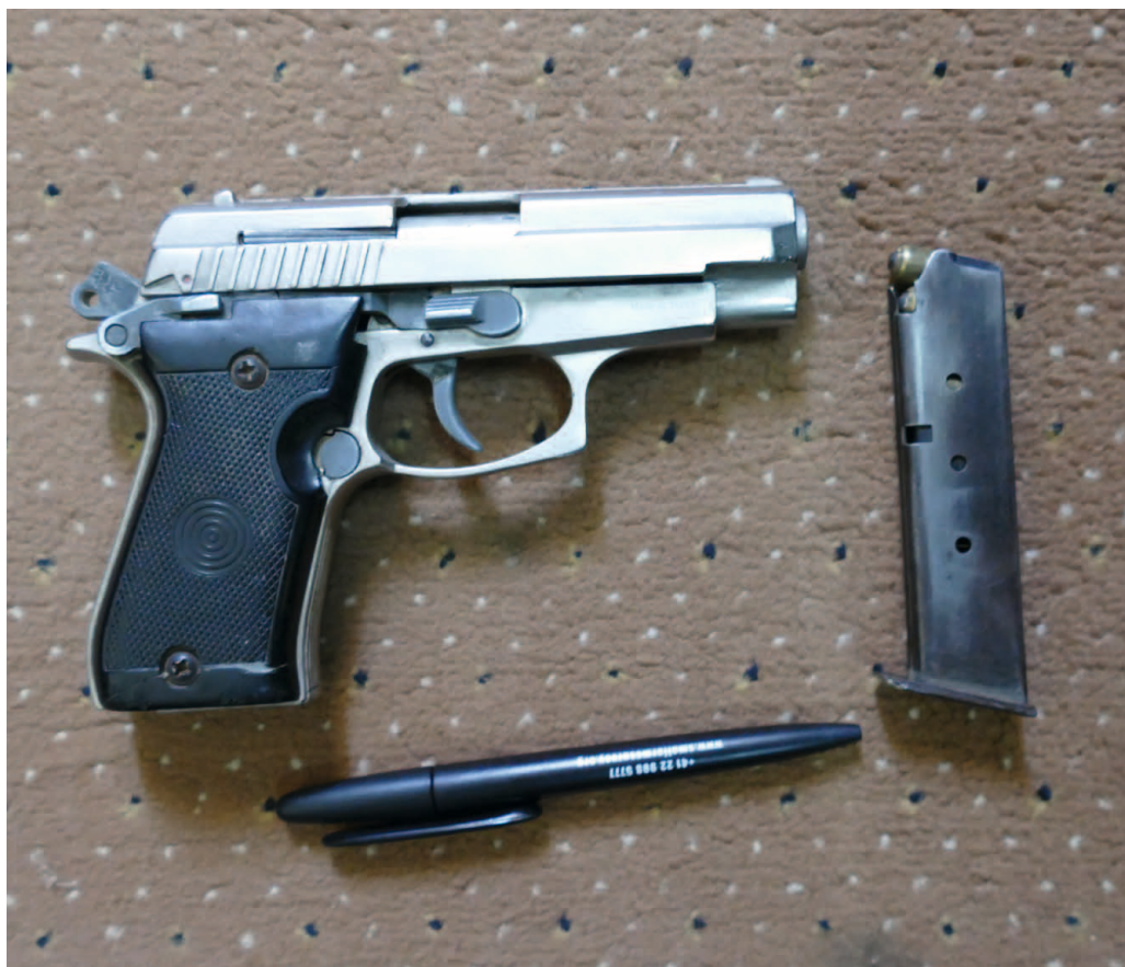
Ekol P29 alarm pistol converted to fire solid projectiles and allocated to an official in Chad. December 2017.

In Niger's main towns, crime scenes generally remain untouched; 59 however, some security agencies responsible for storing seized arms keep the arms for themselves, in breach of applicable conventions. 60 Certain judges in Niger prefer to entrust arms placed under seal to the