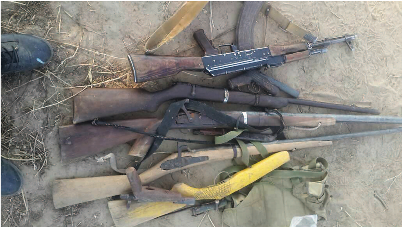
Some of the arms seized during Operation Africa Trigger III, N'Djamena, Chad, November 2017. Source: Confidential

institution. This significantly restricts the capacity of forensic services to identify the arms and to investigate their origins.