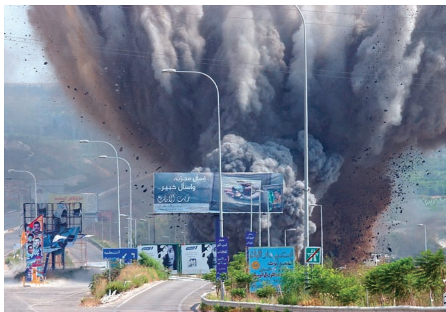
Israeli ordnance detonates in Zahrani, Southern Lebanon, during the 2006 Israel–Hezbollah war.

Hezbollah and Amal meanwhile pursued new grievances with Israel over the Shaba Farms, an Israeli-occupied area in the disputed Golan Heights zone. Only months after the IDF withdrawal in 2000, escalating Israeli–Palestinian violence sparked an engagement between the IDF and Palestinians on the Israel–Lebanon border, prompting Hezbollah to launch its first operation in Shaba, killing three Israeli soldiers. 14 In response, Israeli military patrols again began entering Lebanese airspace and waters. While tensions remained acute for the next six years, casualties on both sides were low. This was a period of ‘harassing fire, aggressive patrolling, and heated rhetoric’ from both parties within informally agreed boundaries. 15