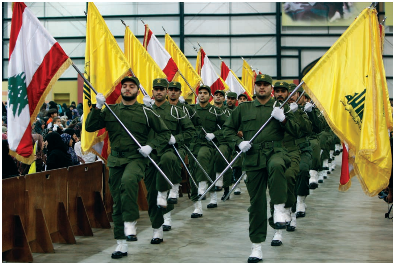
Hezbollah members march during a rally marking Hezbollah Martyrs Day in Dahiyeh, a southern suburb of Beirut, November 2009

While voter support is clearly essential for winning elections, the relation between votes and popular support within specific Lebanese regions is not altogether straightforward.