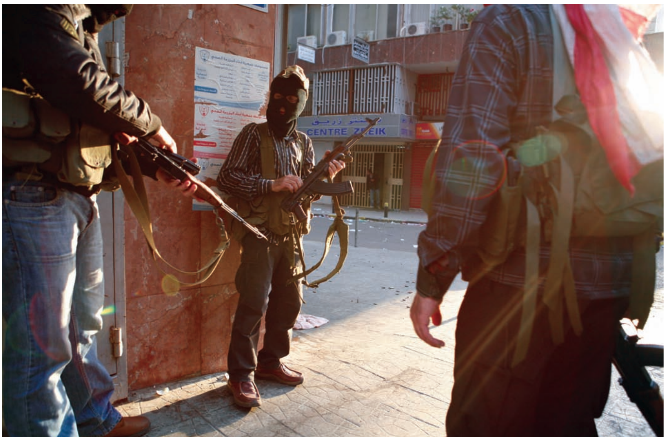
Amal militants take cover and trade fire with government-aligned Sunni forces during the opposition's siege of Beirut in May 2008.

Quantitative and qualitative research on arms, armed groups, and security provision in Southern Lebanon is extremely limited. Local sensitivities