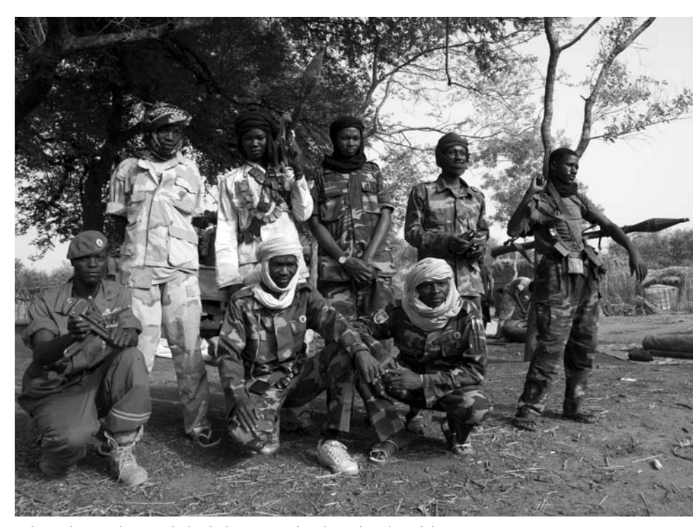
Nuba combatants of JEM, on the border between South Sudan and South Kordofan, May 2012.

The alliance presents many possible advantages for the Darfur movements. In particular, it promises to: