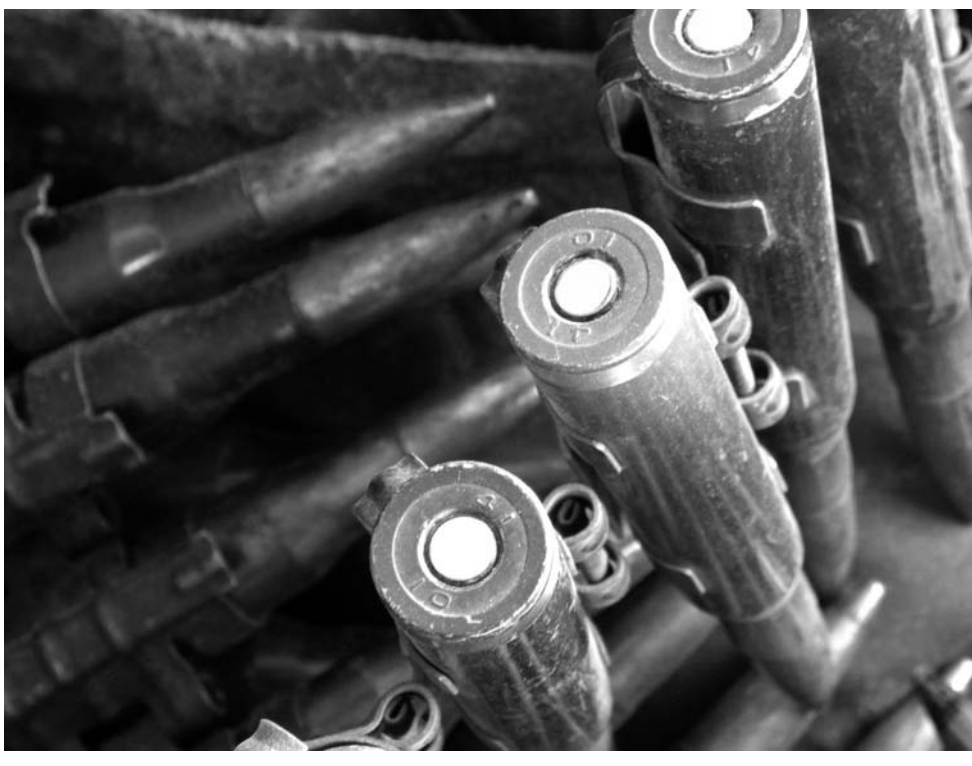
Manufactured in 2010, this 12.7 mm Chinese ammunition is in the possession of JEM forces operating alongside SPLM-N, May 2012. This ammunition was reportedly captured from SAF forces near Jaw in February 2012. It matches ammunition regularly identified as in use by SAF in both Darfur and South Kordofan since 2008.

ambushes and military confrontations against SAF convoys were reported in Darfur during 2011, particularly during the first half of the year. 132 While not always successful, this 'indirect' means of supply clearly contributed to some rebel forces' holdings of small-calibre weapons, ammunition, and vehicles. A limited sample of arms and ammunition observed in rebel forces' hands in Darfur since 2010 confirms that rebel movements rely on a standard suite of weapons that generally matches that of SAF and affiliated militias; the arms include AK-type (mainly T-56 and T-56-I model) automatic rifles, PKM 7.62 mm and DShK 12.7 mm heavy machine guns, RPG-7 launchers, and 82 mm and 120 mm mortars. 133 Likewise, a very limited number of numerical codes appear in the headstamps of cartridges used by all sides (largely '41', '71', and '945'