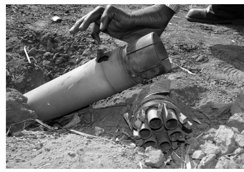
Fragments of 80 mm S8 air-to-ground rockets fired by SAF Su-25 aircraft next to an SPLA base, Firga, South Sudan, February 2011.

convoy. Air attacks in the borderland resumed again in December 2011, with bombings between Firga and Siri Malaga in the first week of December 2011,194 and in Bahr Tumbak north of Boro Medina on 28 December. 195 There were further reported 'Antonov' bombings northwest of Boro Medina on 16 April 2012 and near Siri Malaga on 15 May 2012—the latter provoking the displacement of some 4,500 civilians.196