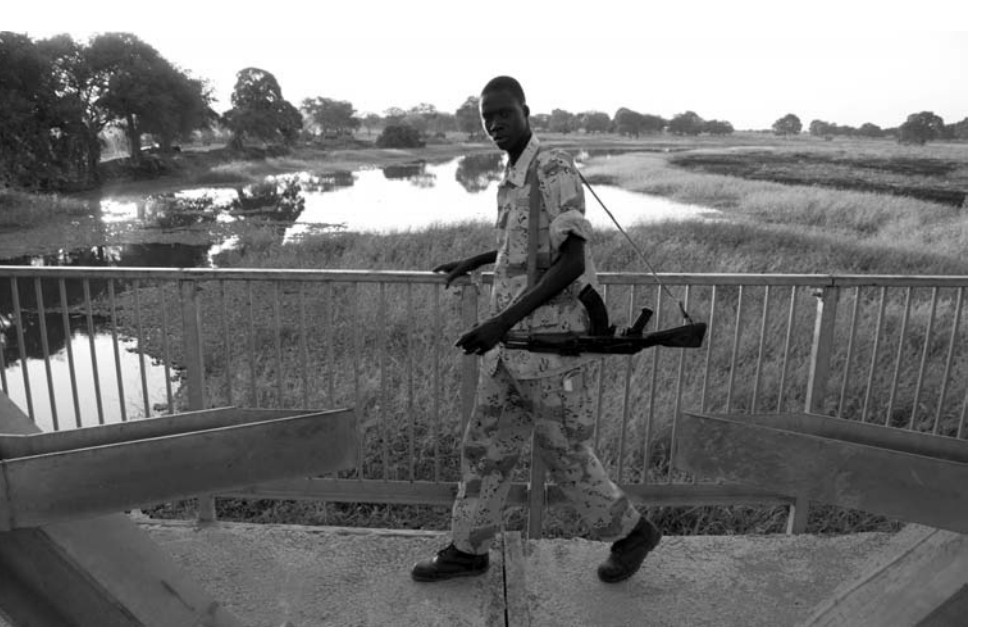
A South Sudanese soldier crosses the bridge linking Samaha to the North and Kiir Adem to the South of the Kiir-Bahr al Arab river. The river is an important resource for people on either side: Rizeigat Arabs of Darfur to the north and Malwal Dinka to the south. The 1956 line that should legally constitute the border between Sudan and South Sudan runs 14 miles (23 km) south of the river, leaving it in Sudan. But the border is disputed by the Government of South Sudan, which has positioned its army at Kiir Adem on the southern bank of the river, and controls and sometimes crosses the bridge. Similarly, Khartoum forces are occupying some areas south of the 1956 line, such as the Kafia Kingi enclave at the border of the Central African Republic.

hopes of building a unified Darfur movement under the GoSS's wing. Much liaison in Bahr al Ghazal—while not necessarily unsanctioned—nonetheless appears to take place under the auspices of senior SPLA officers with a history of involvement with Darfur groups in that region. 163