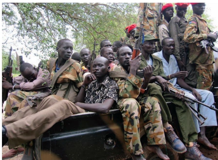
▲ Fighters loyal to Gatluak Gai awaiting integration into the SPLA at an assembly area outside Bentiu, Unity state, August 2011.