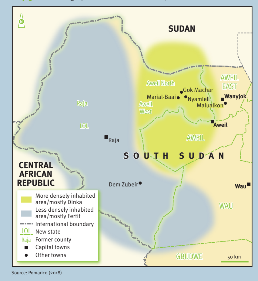
Map 3 The demographic balance of Lol state, 2018