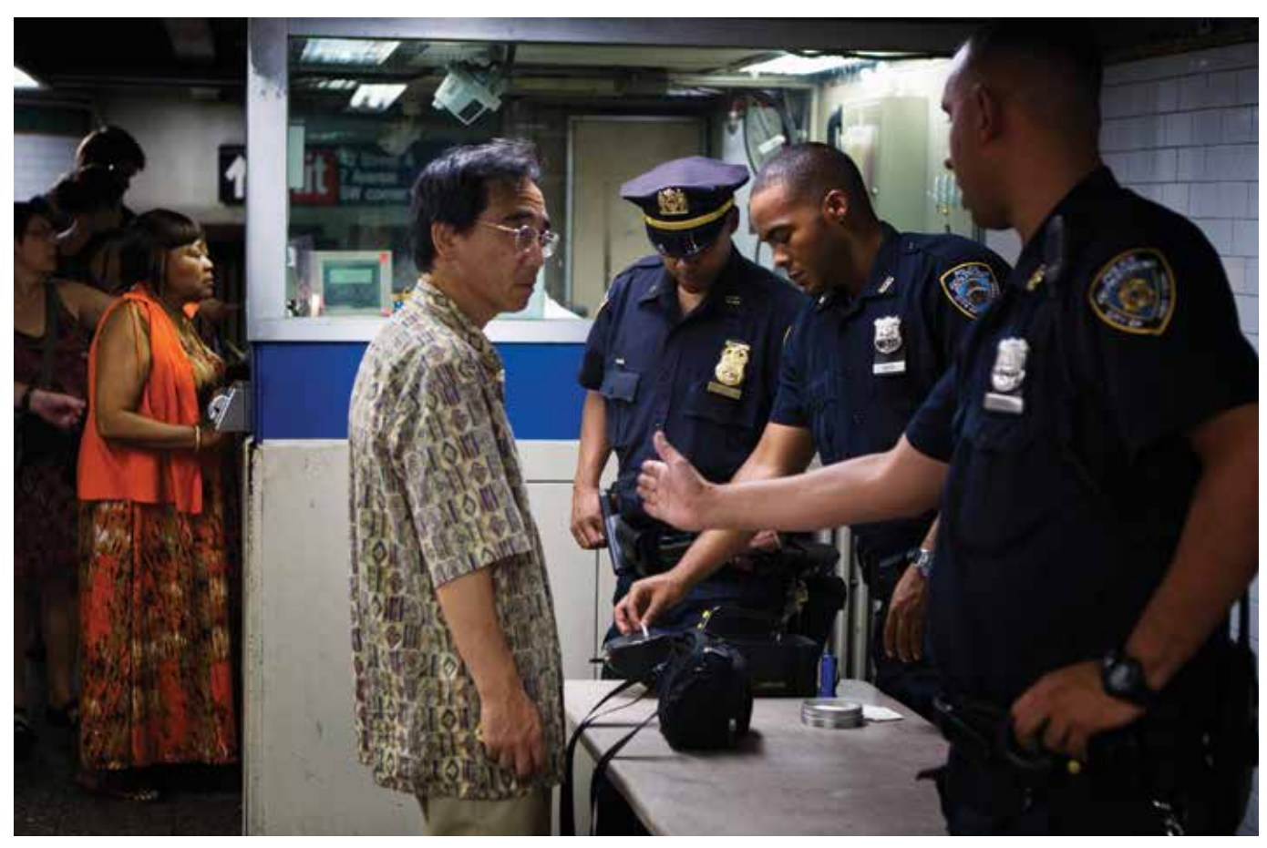
USA, New York: Police officers perform a random bag check at a subway entrance, August 2011.

instruments (arms), and the wider institutional environment that enables armed violence and/or protects people against it (OECD, 2009, pp. 51–55). The 'lens' encourages practitioners to think outside particular programming mandates and consider the wider armed violence problem and what feeds it. In examining the strengths and weaknesses of particular weapons control approaches and initiatives, this paper shows, through illustrations from initiatives undertaken in different parts of the world, that this broader approach, connected as it is with multifaceted arms reduction efforts, is necessary for disarmament strategies aimed at AVRP to be both successful and sustainable. Disconnected interventions have much less chance of making a positive impact.