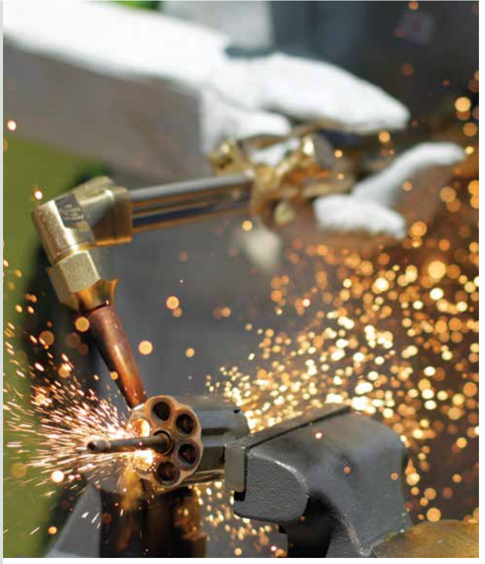
El Salvador. A soldier uses a welding torch to destroy the chamber of a pistol in September 2012, during a program during which the army destroyed over 800 weapons and thousands of rounds of ammunition surrendered by gangs.

In El Salvador in 2005-06 a civil society coalition called Society Without Violence launched a 24-month municipal pilot project in San Martin and Ilopango with the goal of reducing armed violence levels. The campaign was designed around key intervention areas: restrictions on carrying weapons in public, increasing police capacity, changing public attitudes towards guns, and the voluntary surrender of weapons (which was not carried out) (Cano, 2006, pp. 11-12, 56). An evaluation of the project summarized its aims as an attempt to discourage the circulation of arms in public places, which would then result in a drop in violence in those locations (Cano, 2006, p. 56). It was noted that the implementation of the project faced opposition and a lack of political will among municipal governments, who were openly critical of it (Cano, 2006, p. 57). Indicators of violence levels were contradictory. Lethal violence data in San Marino showed a notable reduction in firearms homicides, but Ilopango experienced a rise in homicides (Cano, 2006, p. 60). The lesson learned here is that for disarmament approaches to be successful, political will and local ownership are crucial. Imposing even multifaceted approaches to AVRP on an unreceptive audience will reduce the likelihood of success.