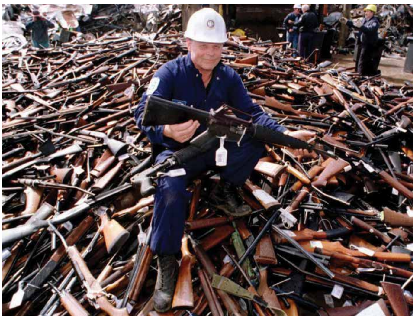
Australia, Melbourne. A security firm employee shows firearms surrendered for destruction after Australia's 1996 legislation banning civilian possession of automatic and semi-automatic rifles.

By October 2005 more than 450,000 firearms had been collected throughout Brazil as part of the campaign (de Souza et al., 2007, p. 576).