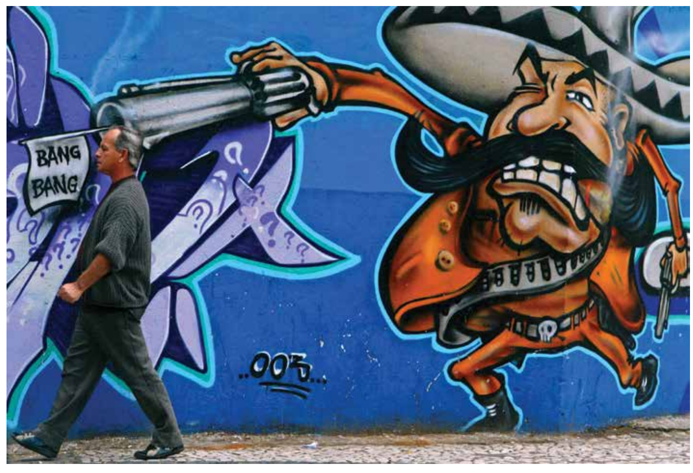
Brazil, Sao Paulo. Graffiti in downtown in Sao Paulo, during a national firearms buy-back program in July 2004.

Knife collections and amnesties face even more difficulties and are even less likely to produce any measurable impact than firearm collections. Knife amnesties run in the United Kingdom, for example, have produced only short-term impacts, because many were not supported by large-scale efforts to address the demand for knives (Eades et al., 2007, p. 27). While knife amnesties appear to produce modest temporary reductions in knife-enabled offences, the study