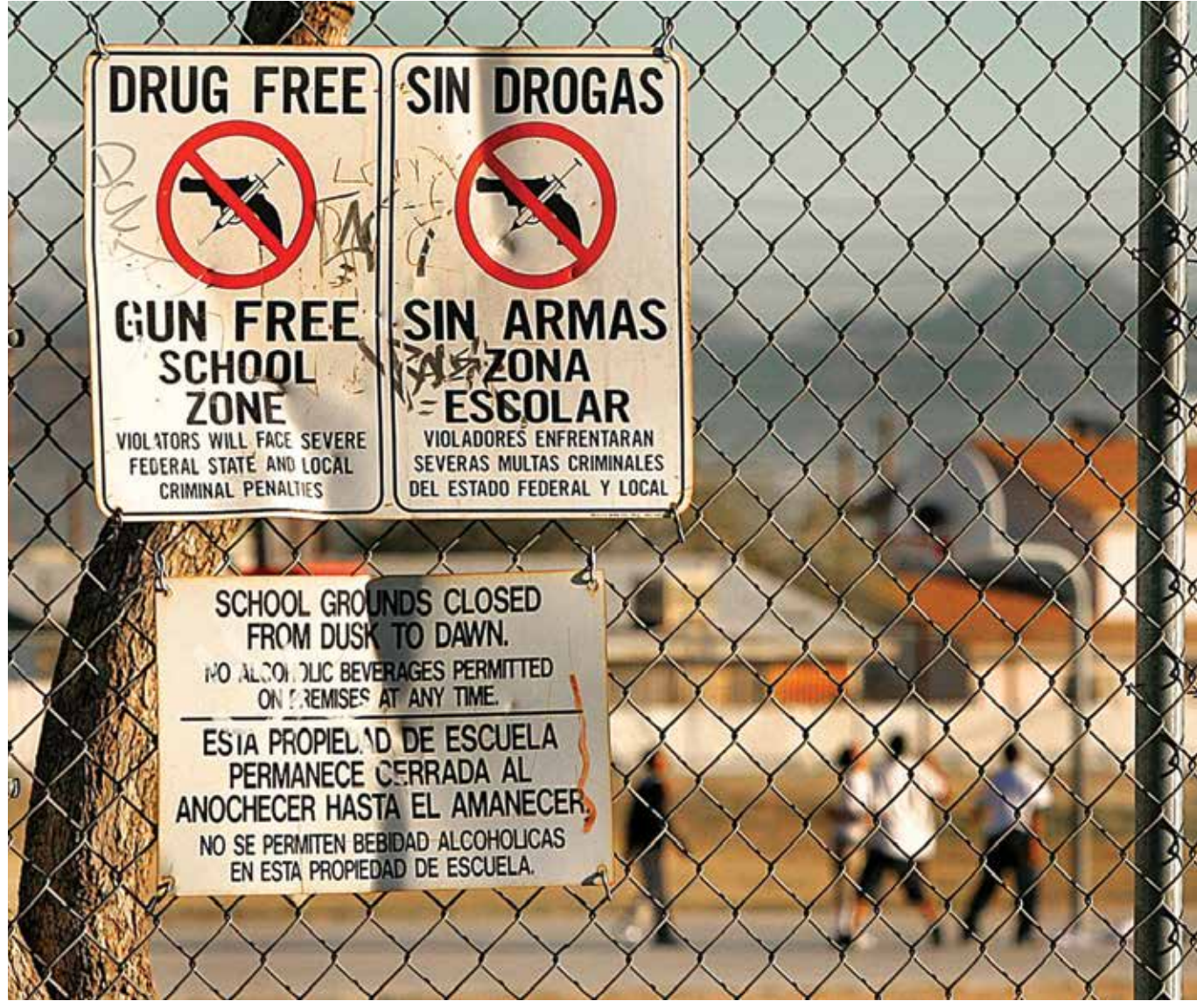
USA, Arizona. Drug and gun-free school zone signs at a Phoenix elementary school. December 2004.

Prohibitions of carrying weapons in violence-prone areas and the introduction of gun-free zones have been widely used forms of AVRP. They are designed to remove the tools of violence and instil public trust in local or state security providers. The examples discussed below from Colombia and South Africa show some positive impacts of these kinds of methods. However, they are representative of direct disarmament approaches to armed violence, and when run in isolation