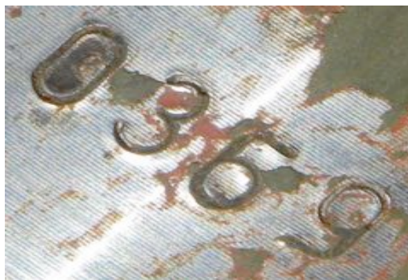
Unknown mortar tube