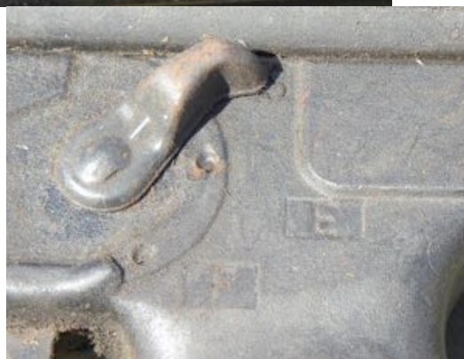
Heckler & Koch HK 11A1 light machine gun