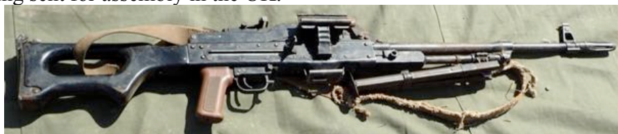
PKM-pattern general-purpose machine gun

The confiscated weapons to be destroyed included a few machine guns. UNMISS and UNMAS destroyed a PKM-pattern general-purpose machine gun and a Heckler & Koch HK 11A1 light machine gun (serial number 11A1 ENDL503378). The marking code suggests that the United Kingdom (UK)'s Royal Small Arms Factory of Enfield manufactured the weapon under Heckler & Koch's licence of over-sea production. The presence of the German Beschussamt Ulm (symbol right of the 'HL' marking) and of the German definitive nitro proof mark (left of the 'HL' marking) suggests that, as per the terms of the licence agreement, Germany produced some of the weapon's parts before being sent for assembly in the UK.