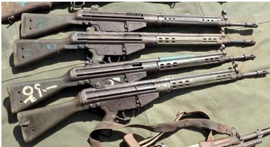
Heckler & Koch G3-type assault rifles prior to destruction

The destroyed sample also contained a number of Heckler & Koch G3-type assault rifles. Several countries produce G3-type assault rifles under licence agreements. In particular, one of the destroyed G3-type assault rifles was reassembled from two different models, originating in Iran and Portugal. As shown in the pictures below, the rifle had Farsi markings and a marking bearing three crossed weapons in a cogwheel on each side of the trigger assembly. These markings are consistent with Iranian-manufactured weapons. The serial number visible on the left side of the magazine catch (G3FMP025040), however, reveals the Portuguese origin of the barrel and receiver block of the weapon, with the marking FMP standing for Fábrica Militar Potuguesa, which is characteristic of G3-type rifles produced by Fábrica de Braço de Prata.