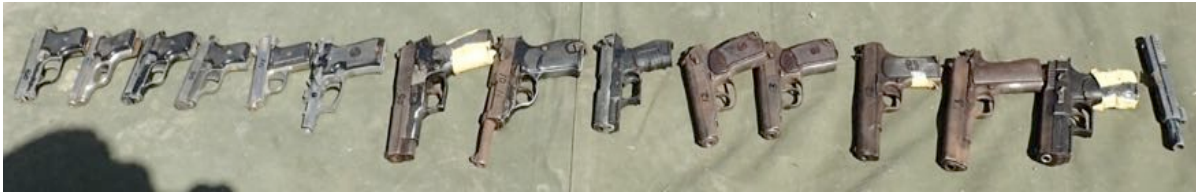
Pistols prior to destruction

The destroyed sample also contained 14 pistols of different models, ranging from a starter automatic pistol to modern semi-automatic pistols produced in China, Germany, and Israel. Conflict Armament Research has sent tracing requests to the governments of Germany and Israel to establish the chain of custody of the following destroyed pistols: a German Walther P22 semi-automatic pistol (serial number GO29301); a West German Sig Sauer P226 semi-automatic pistol (serial number U405371); and an Israeli Jericho 941 PSL semi-automatic pistol (serial number 41307617).