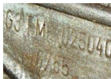
G3-type assault rifle produced in Iran and Portugal