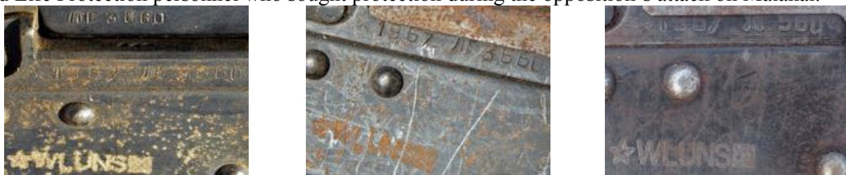
Markings consistent with those in use in the South Sudan Wild Life Protection Services, bearing a star, the letters WL (for Wild Life) and UNS (for Upper Nile State) and a dot matrix code.

At least three of the AK-type rifles bore markings consistent with those used to mark the stockpile of the Upper Nile State's Wild Life Protection Services, during the marking program supported by the Regional Centre on Small Arms in 2011. Due to the lack of information, it is impossible to determine whether the rifles were collected from defectors who joined the opposition with their arms or from Wild Life Protection personnel who sought protection during the opposition's attack on Malakal.