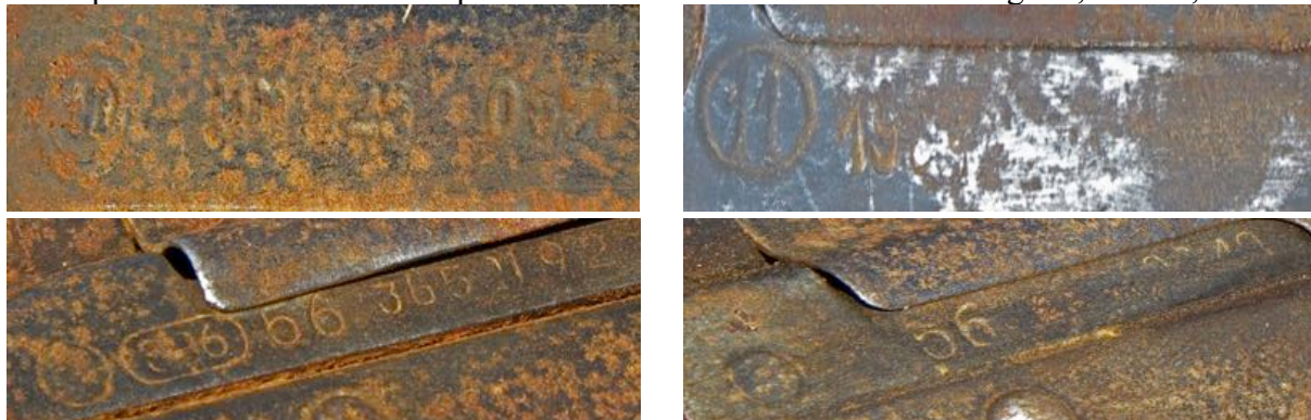
Markings consistent with AKs manufactured in Bulgaria (top left), Poland (top right), and with Type 56 assault rifles produced in China (bottom)

Some AK pattern assault rifles were produced in other countries such as Bulgaria, Poland, and China.