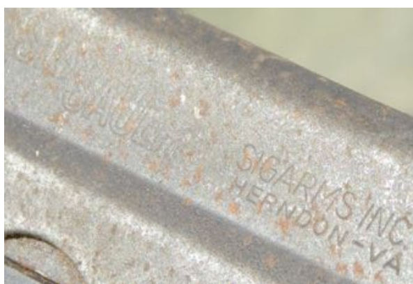
West German Sig Sauer P226 semi-automatic pistol