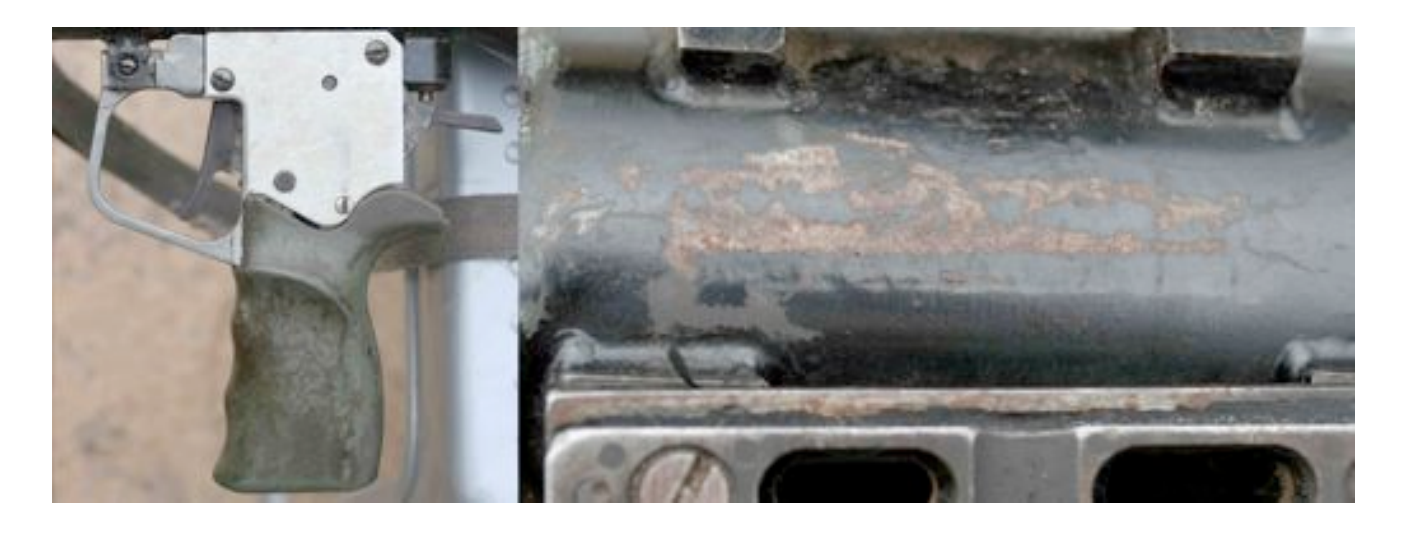
<sup>2</sup> See HSBA Tracing Desk Report 'Weapons seized from the forces of George Athor and John Duit,' December 2012. Available at <a href="http://www.smallarmssurveysudan.org/facts-figures/arms-and-ammunition-tracing-desk.html">http://www.smallarmssurveysudan.org/facts-figures/arms-and-ammunition-tracing-desk.html</a>.

These designs are consistent with types observed in the Survey's February 2013 site visit of weapons. They are also of the same type observed with returning South Sudan Liberation Army (SSLA) forces in Mayom (May 2013), Johnson Olony's forces in Lul, Upper Nile (July 2013), those collected from George Athor's forces (February 2012), and seized from the SSLA in April 2011. In all cases, respective rebel forces report that the weapons have been supplied through Khartoum, though this cannot be independently corroborated. The weapons are similar in design to Iranian RPG-7-pattern models.<sup>2</sup> The trigger assemblies feature no viable identifying marks although a serial number (formerly positioned on the launch tube above the sight bracket) appears to have been removed by grinding and later painted (see images below).