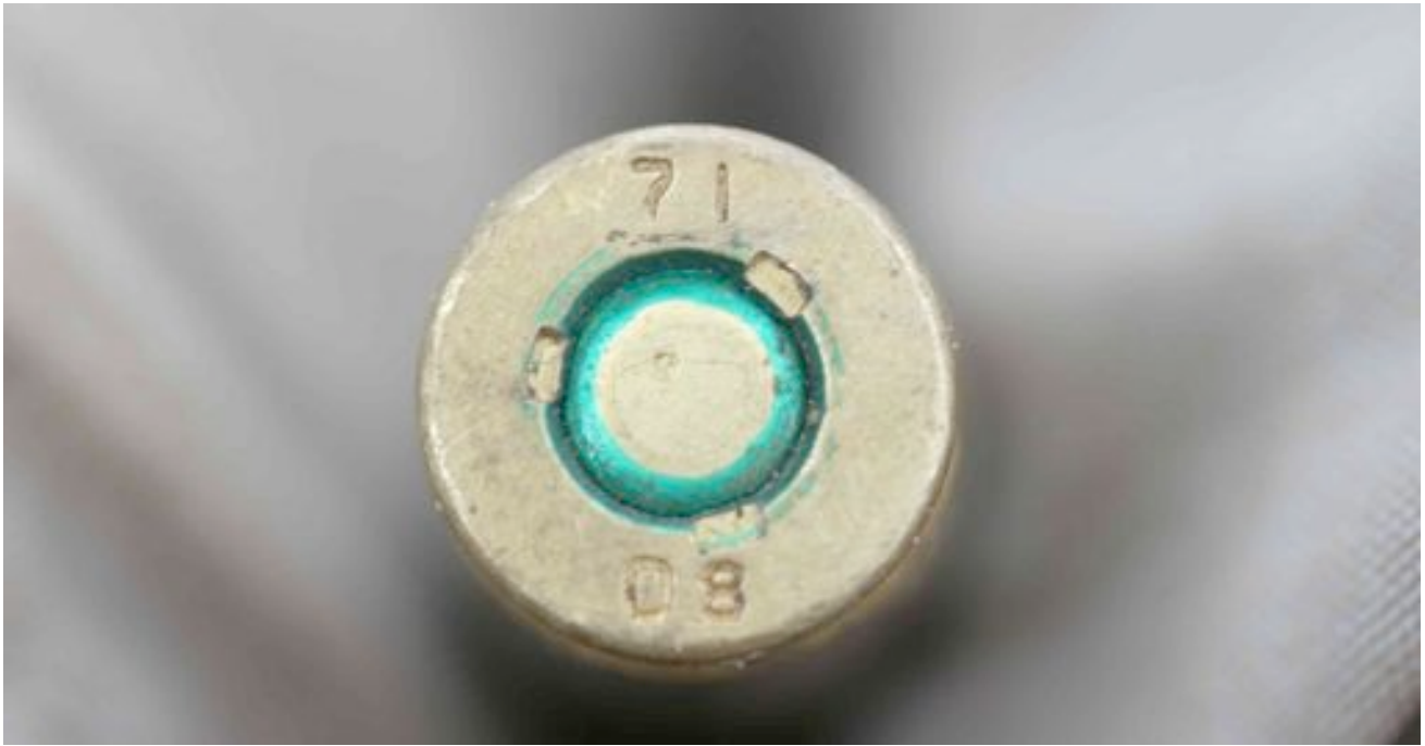
This 5.56 x 45 mm ammunition is marked '71,' a factory code used by the Chinese Factory 71 (the Chongqing Changjiang Electrical Group). The date mark ('08') indicates manufacture in 2008. The Small Arms Survey has documented identically marked 5.56 x 45 mm ammunition in service with David Yau Yau's forces in Jonglei in February 2013.