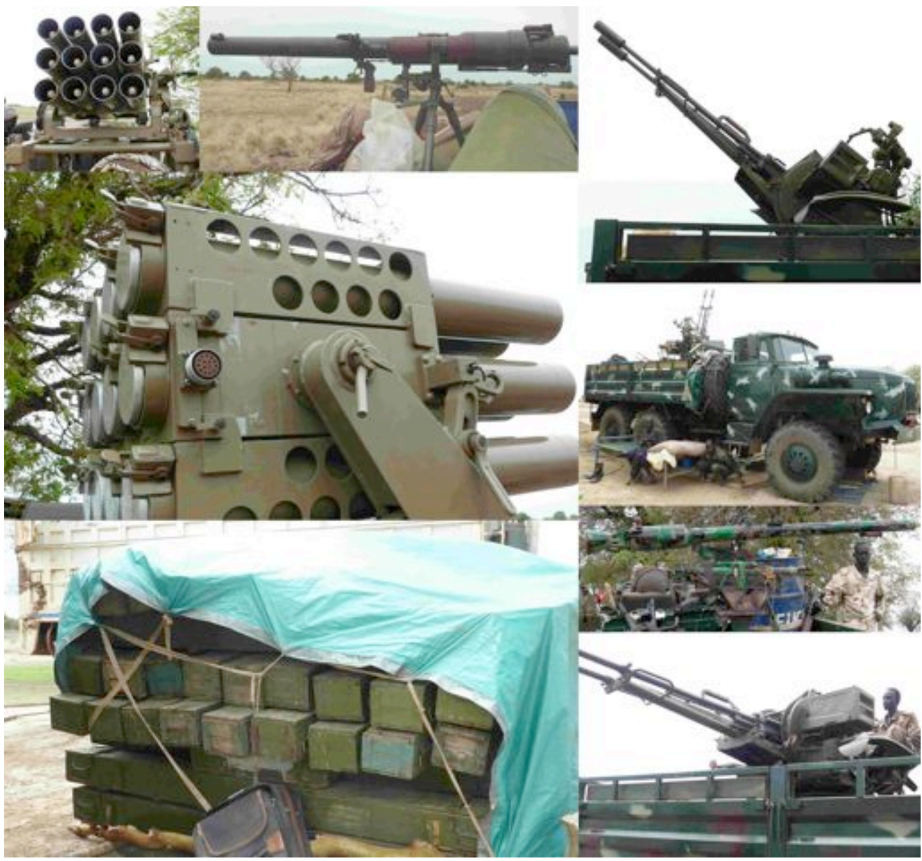
Clockwise from top left: Iranian-pattern BM-12 type 107 mm rocket launcher; Chinese-manufactured Type 65 (B-10) recoilless rifle (marks removed by grinding); ZU-23-2 23 x 152B mm twin-barrel cannon; ZU-23-2 twin-barrel cannon mounted on a six-wheel truck; unidentified SPG-9-pattern recoilless gun (marks removed by grinding); ZU-23-2 twin-barrel cannon mounted on a six-wheel truck; boxed 9M22M 122 mm rockets for use in BM-21 truck-mounted multiple rocket launcher (BM-21 launcher not present); and an Iranian-pattern BM-12 type 107 mm rocket launcher. Sudan's MIC claims to produce identical BM-12 type rocket launchers.