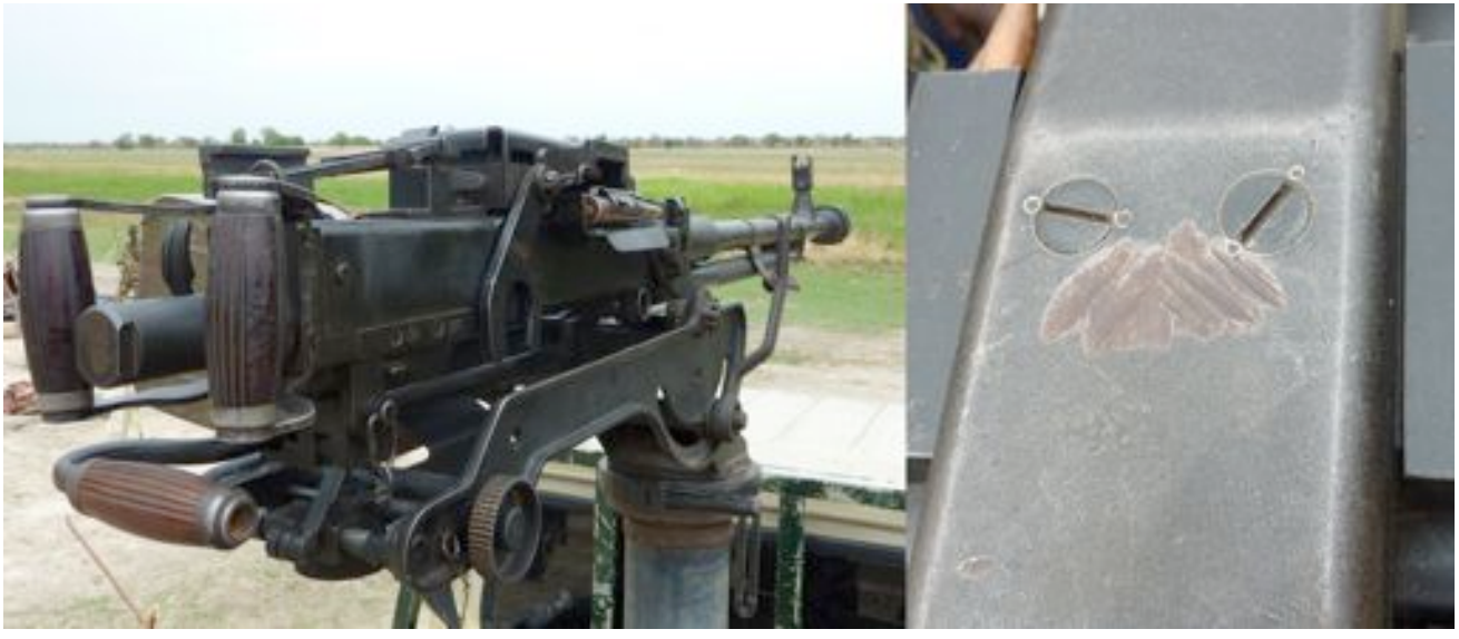
The SSLA deployed in excess of 30 DShKM-pattern heavy machine guns. In all cases, the weapons' identifying marks (see image above, right) had been removed by grinding.

Sudan Human Security Baseline Assessment (HSBA) for Sudan and South Sudan Small Arms Survey 47 Avenue Blanc 1202 Geneva, Switzerland http://www.smallarmssurveysudan.org