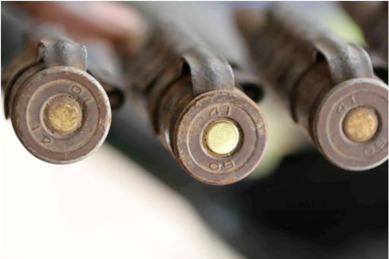
This Chinese-manufactured (Factory 41) 12.7 x 108 mm ammunition for heavy machine guns is date-marked 2009 and 2010. The Small Arms Survey has documented identically marked ammunition that the SPLM-North had seized from SAF forces in South Kordofan and Blue Nile.