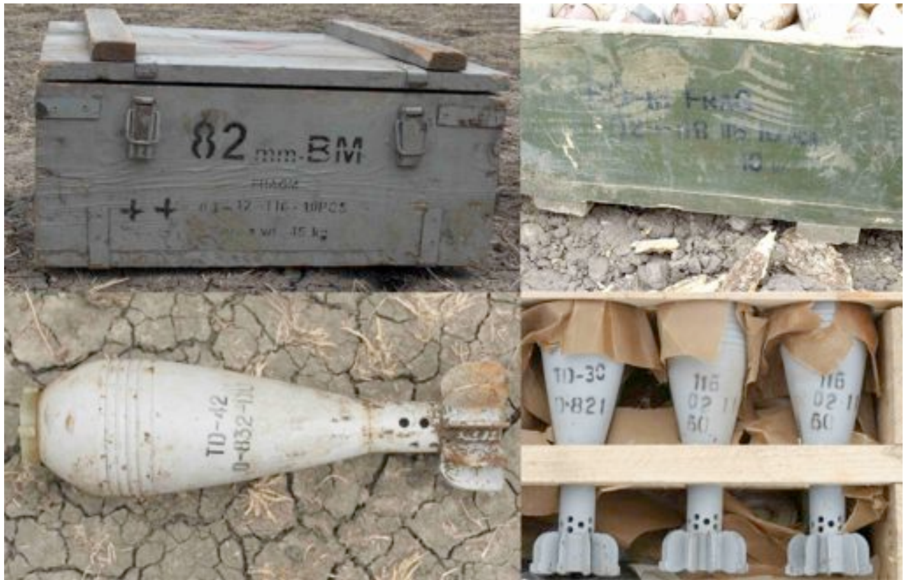
The above images document boxed 82 mm (top and bottom, left) and 60 mm (top and bottom, right) mortar bombs. The box marks, and the marks applied to the mortar bombs, are consistent with suspected Sudanese-manufactured bombs. The Small Arms Survey has documented the same types in service with SAF and various rebel groups throughout Sudan and South Sudan. These 60 and 82 mm mortar bombs were produced in 2011 and 2012, respectively, which suggests very recent supply to the SSLA. The fill codes (TD-42 and TD-30, respectively) are of a type employed for mortar bombs manufactured by the former Soviet Union and aligned states.